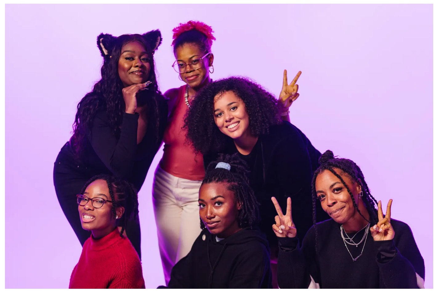
Members of Black Girl Gamers